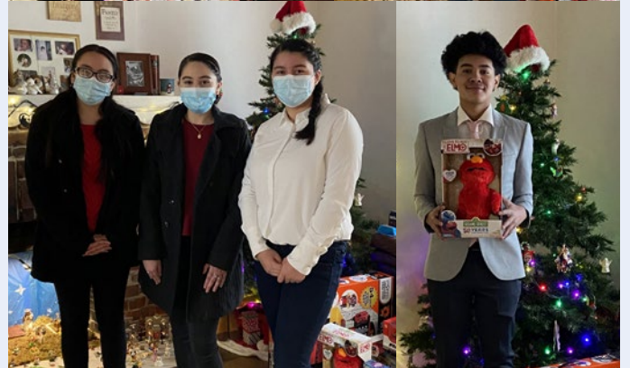
East Bay Scholars collect toys for Oakland Fire Department's 2020 Toy Drive